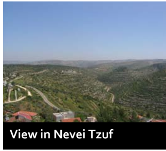
View in Nevei Tzuf

Join BTYA's Chanukah tour, for the whole family, in English! On the Sunday of Chanukah (28 Kislev, Dec 1), a school vacation day. To include: