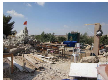
The Beit Knesset

The Sefer Torah and seforim were taken away before the disgraceful act took place.