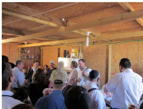
The inside of the Davis' home

Complete destruction means no house, no walls, roof, bathroom...nothing left. The electricity and water hookup has been destroyed. Bulldozers do not do a good job discerning between building materials and personal effects.