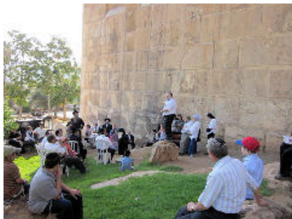
The Rav Sets the Tone for Shabbos