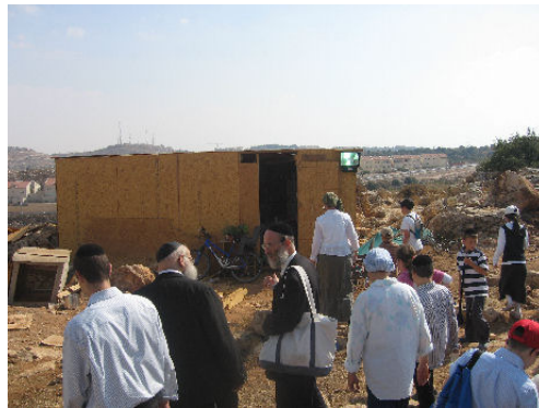
When a Sukka is Your Diras Keva