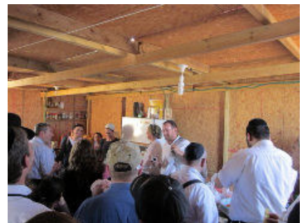
Inside Their "Home"