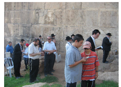
Mincha by the 7th Step